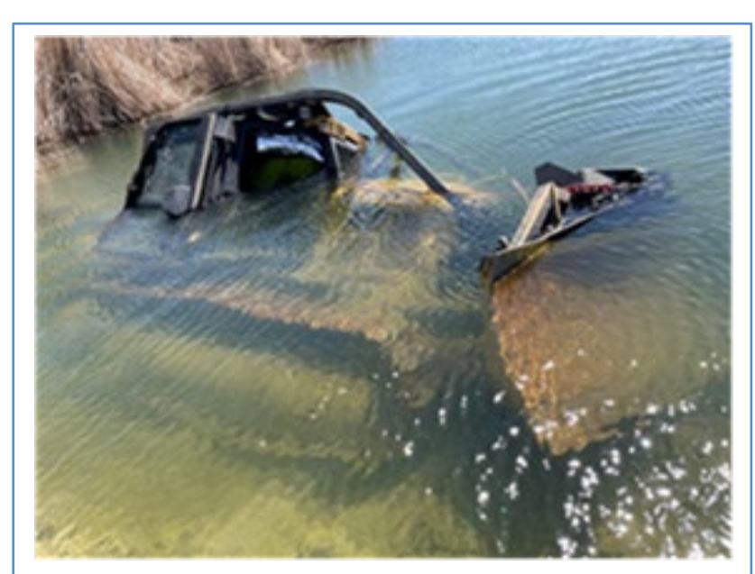
Picture taken from the "rip-rap" where the TFLD(t) jumped in to assist the DZOP(t).

After the supervisor reviewed the incident he requested Critical Incident Stress Management (CISM) support, which was provided the next day by the Texas A&M Forest Service.