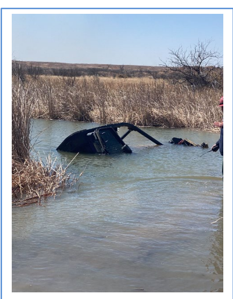
The dozer submerged in the water after the "rip-rap" gave way.

An RLS "Learning Team" was convened to assist the Texas A&M Forest Service with reviewing this event and sharing any lessons learned from the incident. After evaluating the actions surrounding the event, the team determined that although there was an unplanned event, the decisions made by those involved reflected a solid and capable fire program. Resources were within policy and training regarding this wildland fire and acted reasonably and professionally during all phases of the operation.